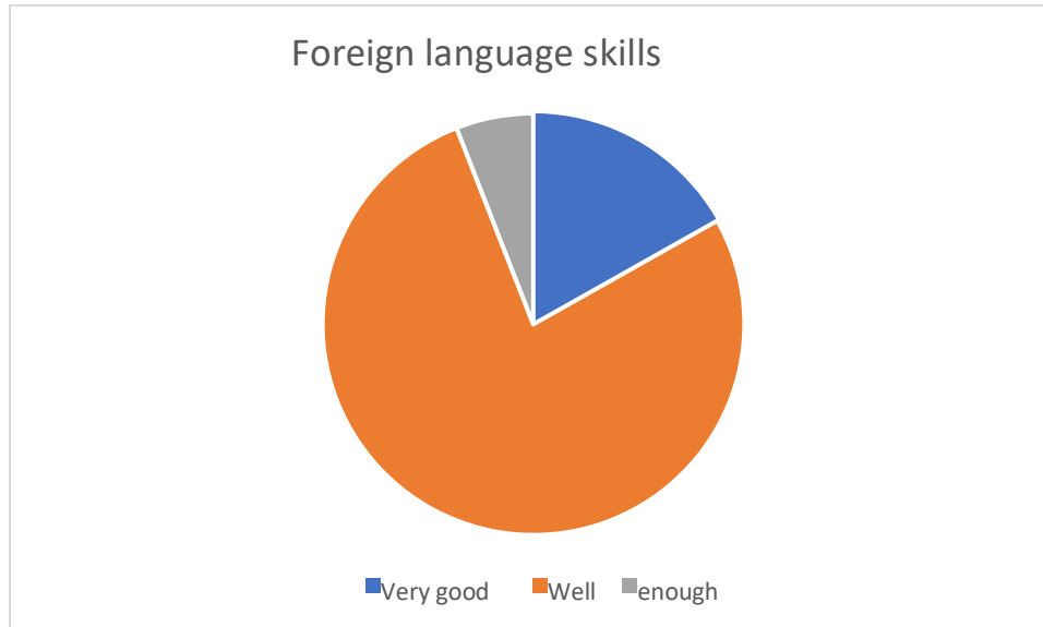
Figure 3 Foreign Language Proficiency

The survey results show that the majority of Doctor of Social Sciences students, namely 78%, have good foreign language skills, 17% of students have good expertise in the field of science (main competency), and 6% have sufficient foreign language skills.