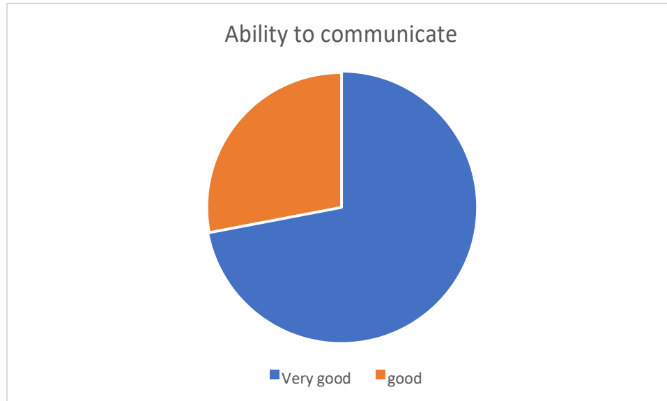
Figure 5 Ability to communicate

The survey results showed that most of the Doctoral students in Social Sciences, namely 72%, had very good communication skills and 28% of students had good communication skills.