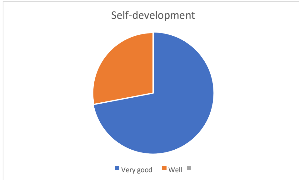
Figure 2 Expertise in the Field of Science (Main Competencies)

The survey results show that the majority of Doctor of Social Sciences students, namely 61%, have very good expertise in the field of science (main competence), 33% of students have good expertise in the field of science (main competency), and 6% of students have expertise in the field of science ( core competencies) sufficient