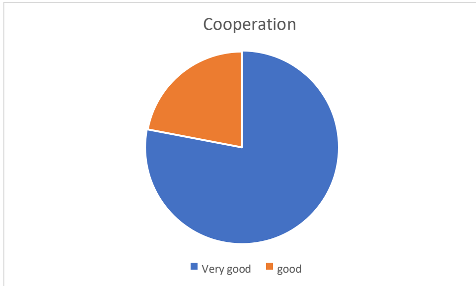
Figure 6 Cooperation

The survey results showed that most of the Doctoral students in Social Sciences, namely 78%, had very good cooperative skills and 22% of students had very good cooperative skills.